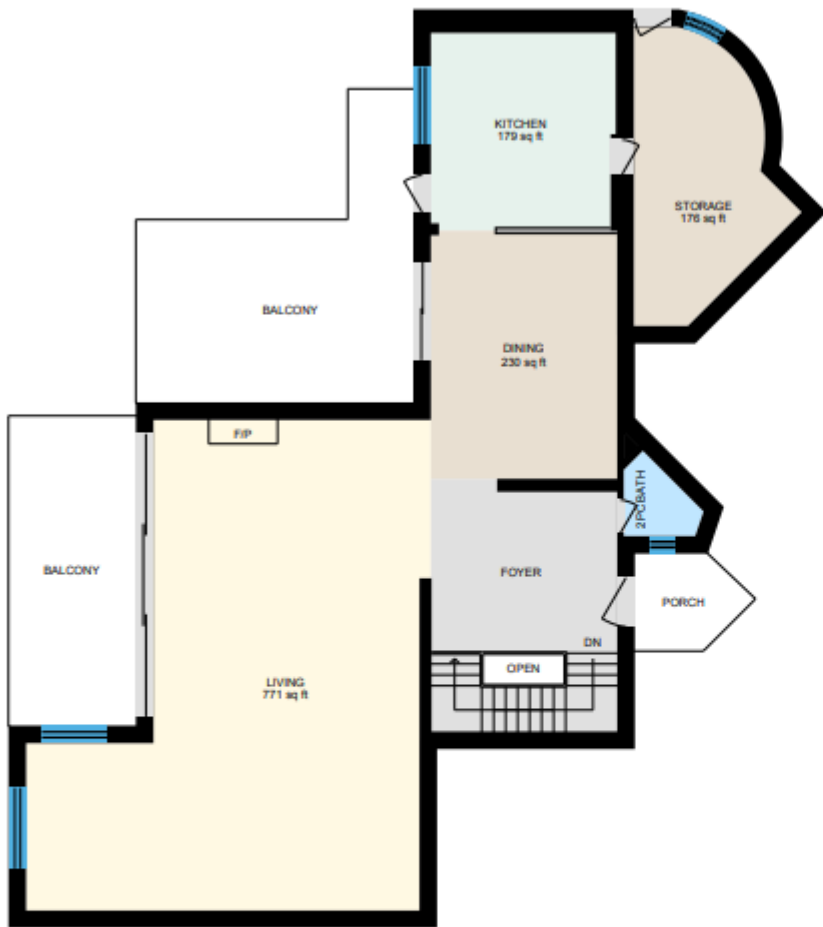
Main Floor Exterior Area 1949.14 sq ft

Main Building: Total Exterior Area Above Grade 3869.35 sq ft