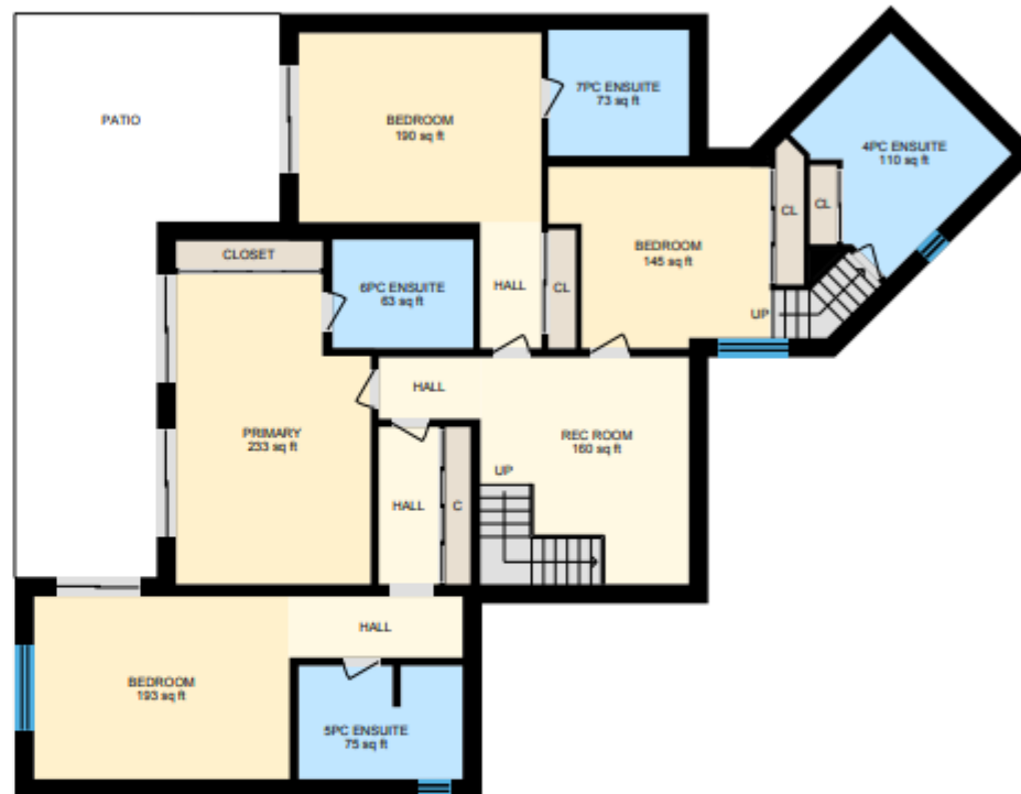
Basement Exterior Area 1920.21 sq ft